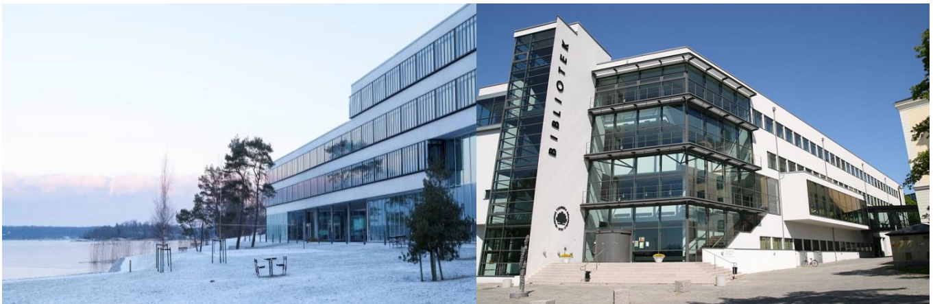
Campus Karlskrona of BTH and Library

*Bachelor Qualification Plan will comprise of agreed curricula, pre-requisite courses, conditions for award of the degree at BTH.