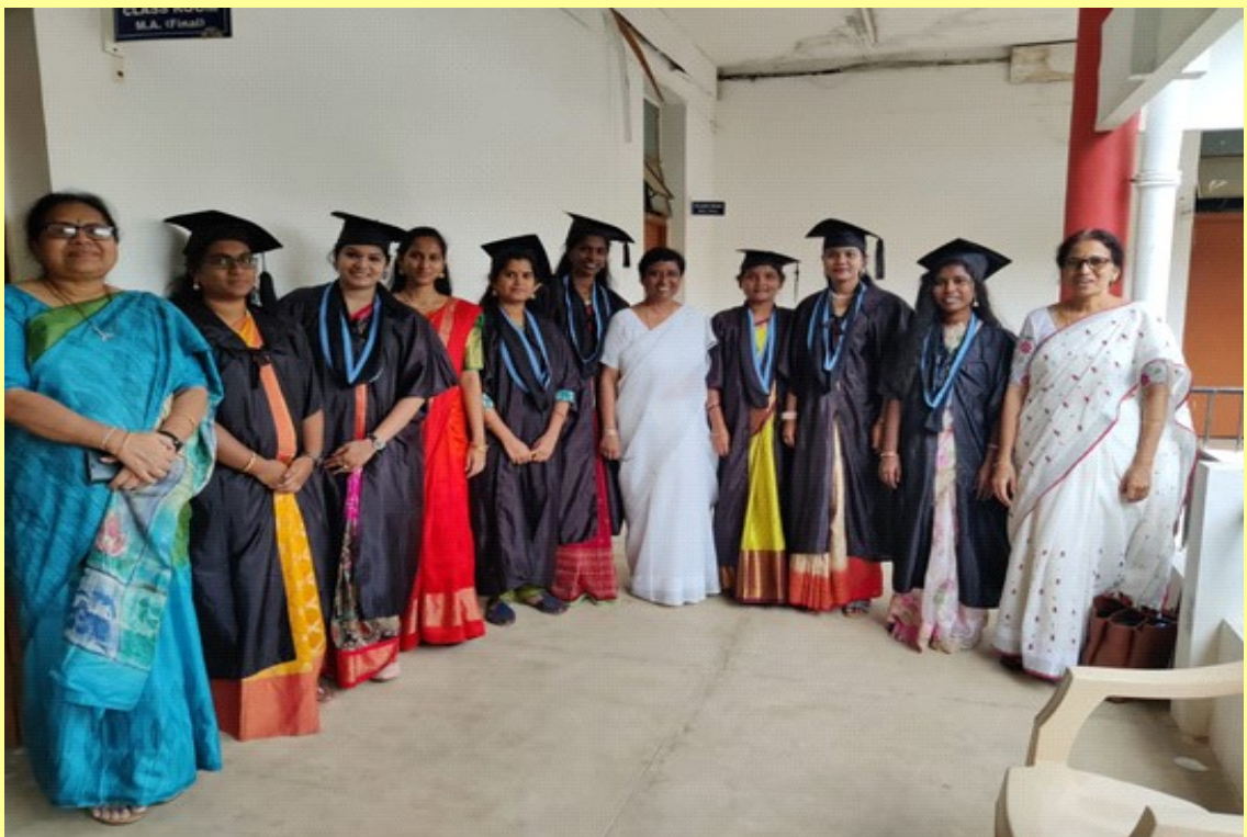
M. A. Post Graduates with the Faculty