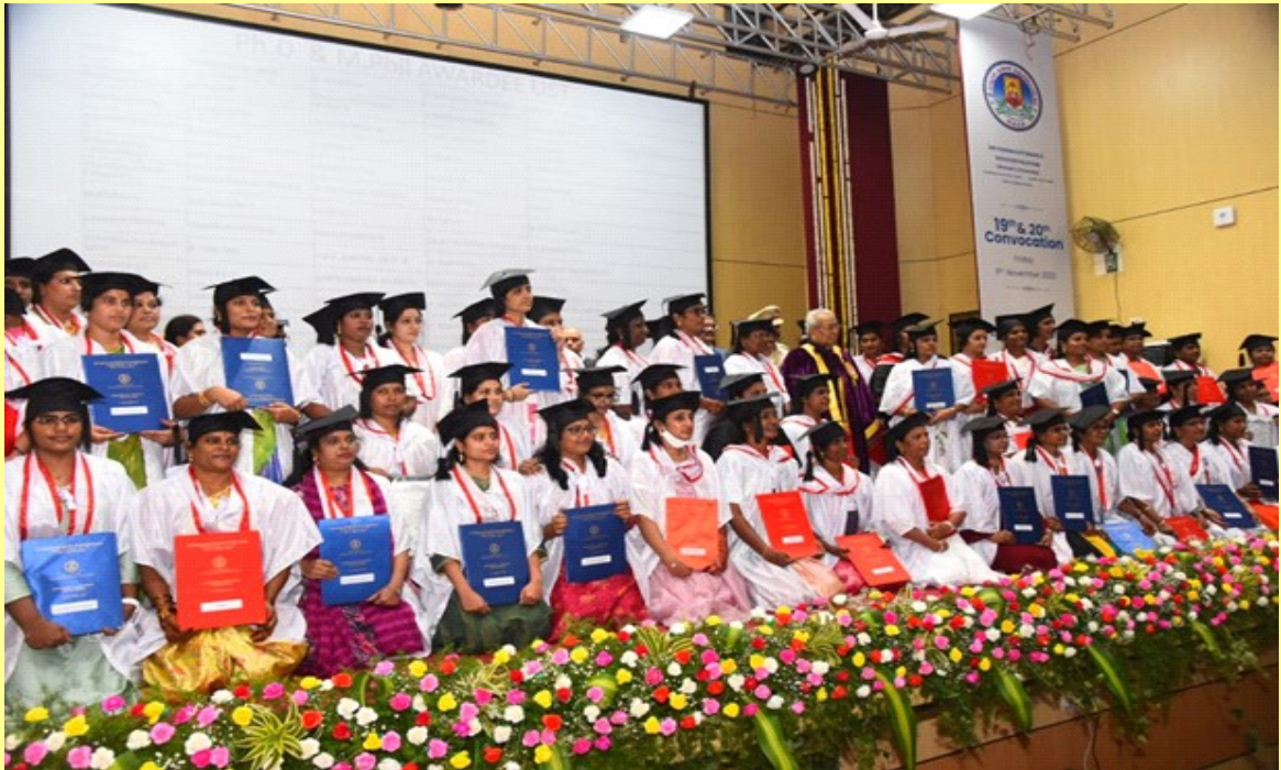
Ph.D. Awardees with the Chancellor